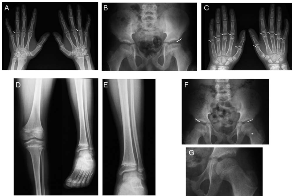
Figure 4. A , Standard radiograph of the hands and wrists of individual II.3 at age 20 years. Flattening, underdevelopment, and squaring of the heads of the metacarpal bones, particularly at metacarpal IV bilaterally, are indicated ( arrows ). Also note bilateral clinodactyly as an incidental finding. B–E , Radiographs of individual II.9 at age 10 years. B , Standard radiograph of the pelvis. Flattening and irregular delineation of the left femoral epiphysis are indicated ( arrow ). Also note the broadening of the femoral neck, particularly at the left side. C , Standard radiograph of the hands and wrists. Subtle flattening and squaring of the metacarpal heads are indicated ( arrows ). D , Standard radiograph of the left knee and lower leg. Note slight overtubulation and narrowness of the diaphyses of the femur, tibia, and fibula. E , Detail of the left tibia and fibula. F , Standard radiograph of the pelvis of individual II.10 at age 7 years. Slight flattening and irregularity of the femoral epiphyses are indicated ( arrows ). Also note the broadening of the femoral neck, particularly at the left side ( asterisk [*]). G , Spot view of the slightly flattened and irregular left femoral epiphysis of individual II.10.

exon 3 in the other two COL9 genes. Therefore, it was surprising that the splice-site mutation in COL9A1 that causes MED did not result in skipping of exon 9. The reason why mutations group around the donor/acceptor sites of exon 3 in COL9A2 and COL9A3 and around exon 8 in COL9A1 is not yet clear. It is plausible that the resulting deletion of amino acids from this domain of type IX collagen may disrupt interactions with other components of the cartilage. This may be caused by the deletion of a binding site within the COL3 domain. Another possibility is that the orientation of the \alpha 1(\text{IX}) NC4 domain relative to the type II/XI collagen fibril is changed by the mutation.